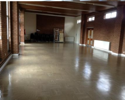
We provide stacking chairs and folding tables