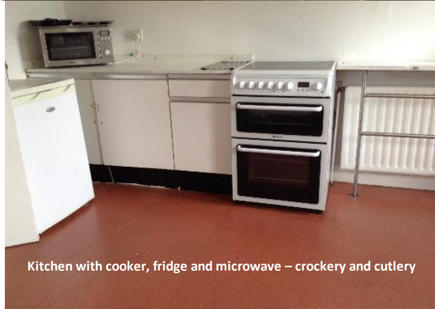
Kitchen with cooker, fridge and microwave – crockery and cutlery