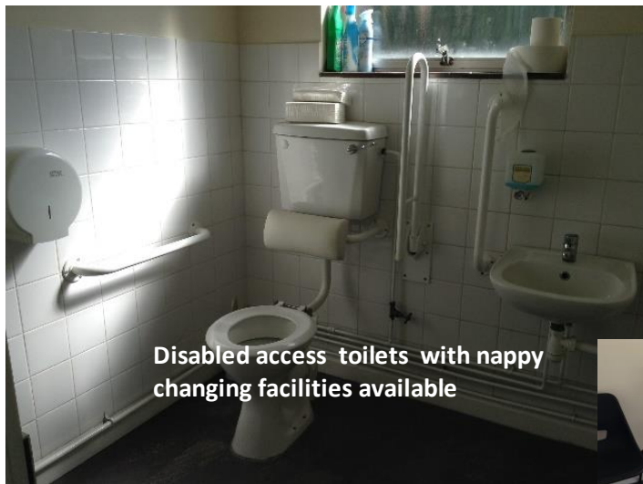
Disabled access toilets with nappy changing facilities available