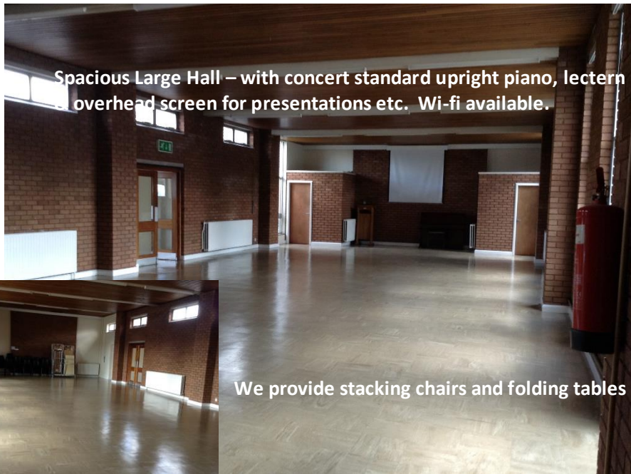
Spacious Large Hall – with concert standard upright piano, lectern & overhead screen for presentations etc. Wi-fi available.