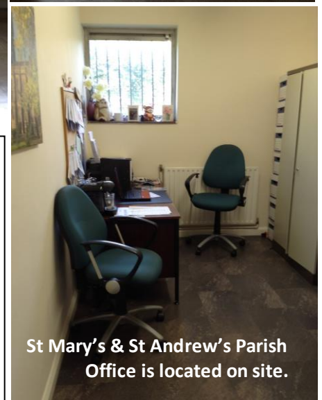
St Mary's & St Andrew's Parish Office is located on site.