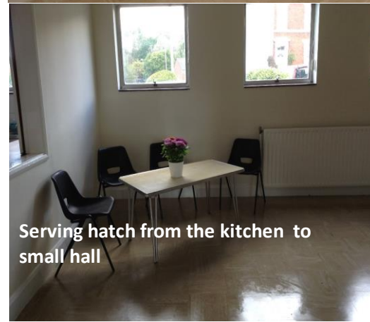
Serving hatch from the kitchen to small hall