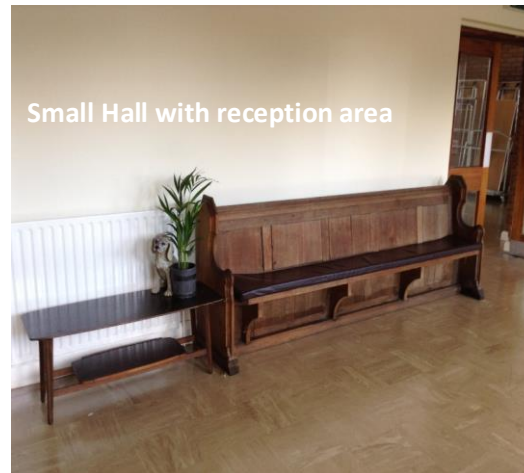
Small Hall with reception area